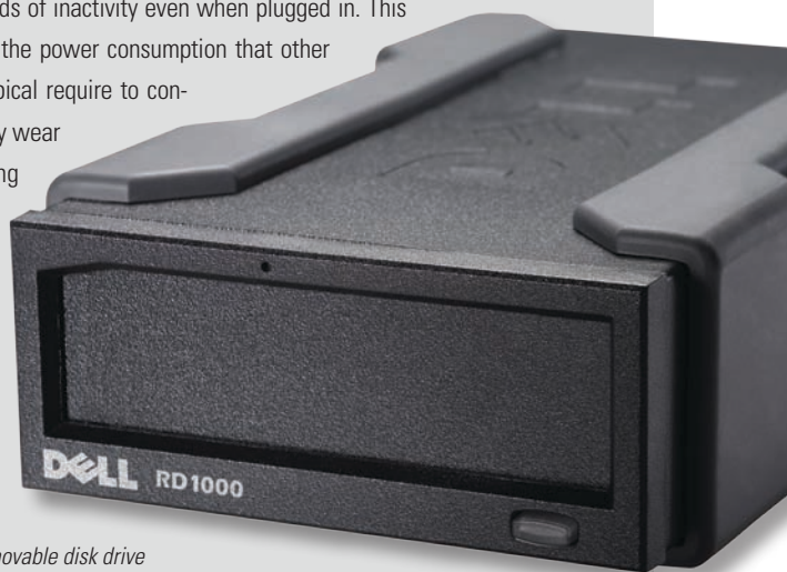
Dell PowerVault RD1000 removable disk drive

—Curt Krempin Product marketing manager, Dell Enterprise Product Group