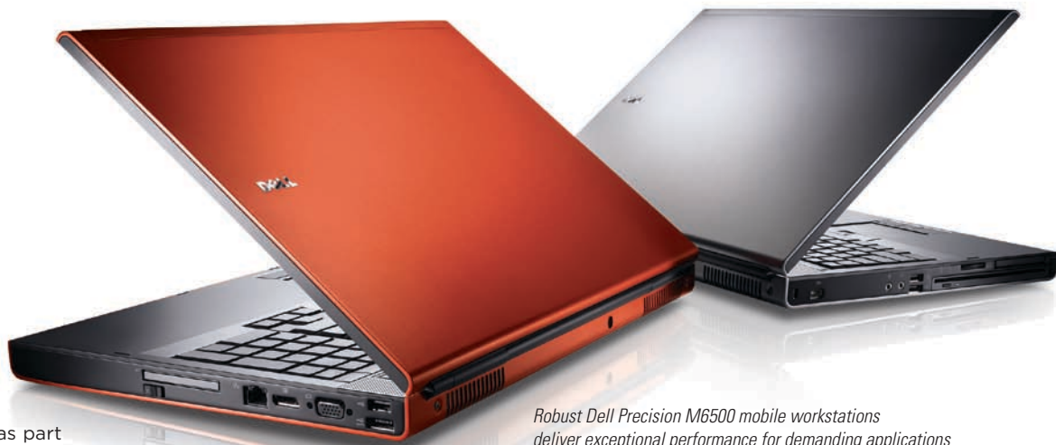
Robust Dell Precision M6500 mobile workstations deliver exceptional performance for demanding applications

organizations may decide to refresh other systems with the latest Dell clients as part of the migration process. Dell OptiPlex desktop, Dell Latitude laptop, and Dell Precision workstation product lines include multiple models that can be configured to capitalize on Windows 7 enhancements (see Figure 2). The broad range of Dell client systems available for Windows 7 gives organizations the flexibility to select the appropriate mix of client systems for a comprehensive range of usage scenarios.