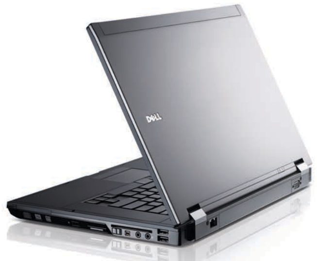
Secure Dell Latitude E6410 (left) and Latitude E6510 laptops help mobile workers stay connected on the road