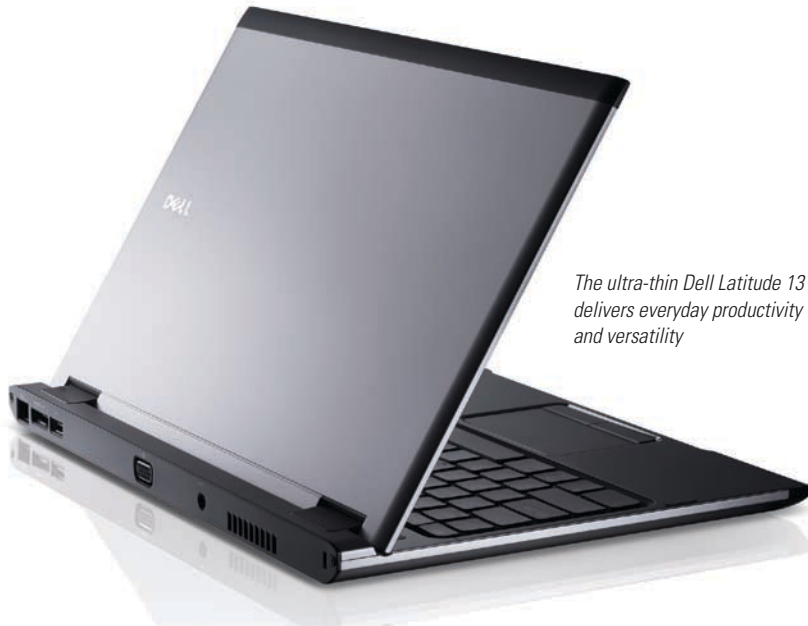
The ultra-thin Dell Latitude 13 laptop delivers everyday productivity and versatility

with Windows 7. Windows XP Mode uses the latest Microsoft virtualization technology, Windows Virtual PC (formerly Microsoft Virtual PC), to create a virtual Windows XP environment. Windows XP-based applications are available to users straight from the Windows 7 taskbar or Start menu. Applications can continue to access many of the system's hardware resources, including the DVD drive, hard drive, and USB-compatible peripherals.