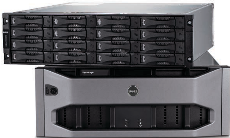
Dell EqualLogic PS Series SAN arrays offer robust storage in Microsoft Windows Server 2008 R2 Hyper-V environments

Designed as high-availability virtualized storage solutions, Dell EqualLogic PS Series iSCSI SAN arrays can be an excellent fit for data centers virtualized with Hyper-V technology. Storage is virtualized in EqualLogic PS Series arrays, and data volumes are provisioned automatically from a single scalable storage pool. The EqualLogic peer storage architecture enables the arrays to share resources, evenly distribute workloads, and provide data protection for the VMs in virtualized environments. Resources are applied automatically even as VMs and their workloads change.