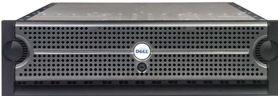
Figure 1: Dell PowerVault MD3000i Storage system with 15 SAS drives – Front view