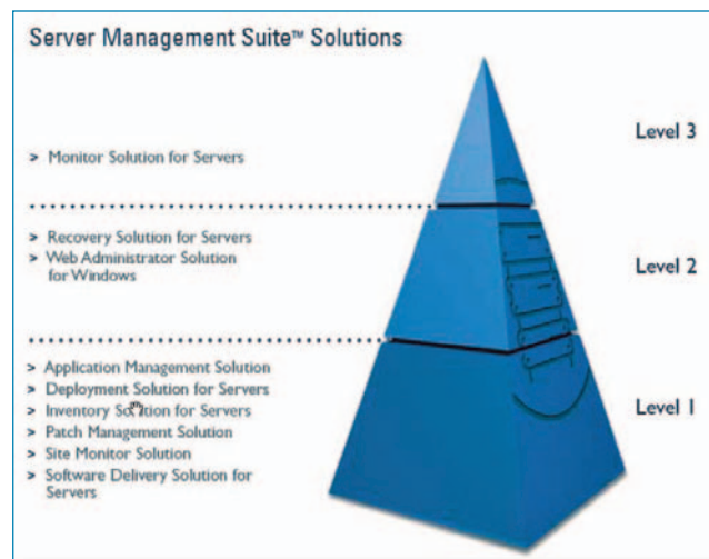
Figure 1 – Altiris Server Management Suite Solutions Pyramid

Additionally, Altiris offers an extensible modularized architecture, allowing for IT personnel to add additional management capabilities as required. Altiris packages its product offerings into management suites . For example, there are the Asset Management , Client Management , and Server Management suites, each comprised of several products (see the Server Management Suite example Figure 1).