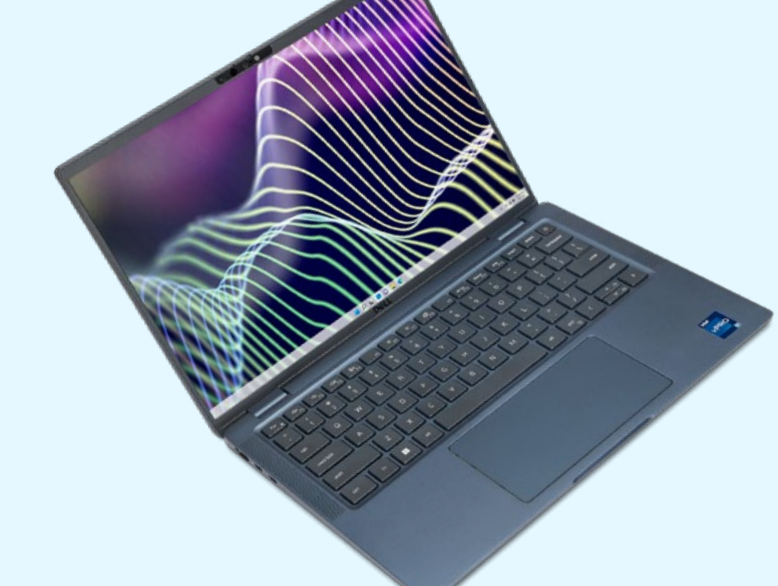
LATITUDE 7440 ULTRALIGHT

World's smallest and lightest 14-inch premium commercial laptop 8