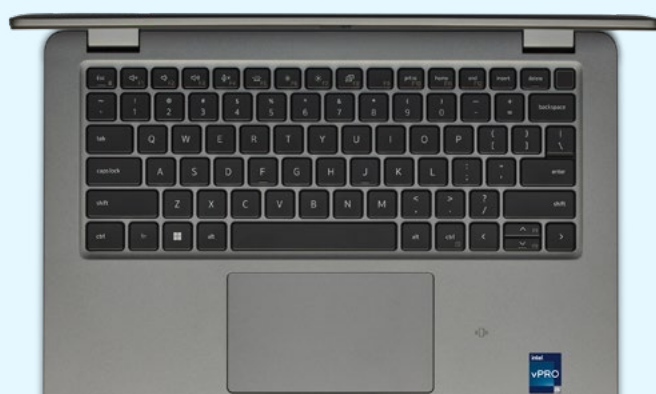
LATITUDE 5000 SERIES

World's smallest 9 and most scalable 10 mainstream business laptops