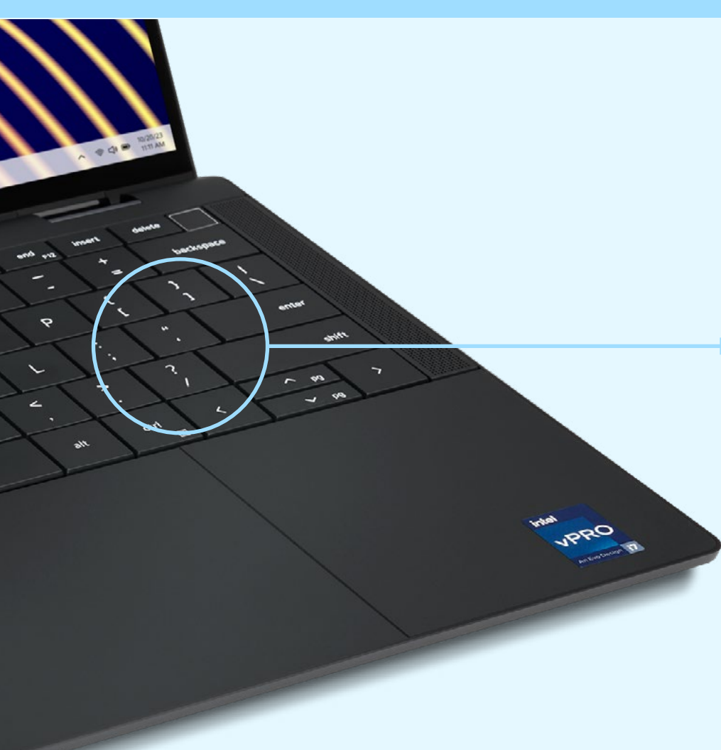
LATITUDE 9440 2-IN-1

Optional Intelligent Privacy features from Dell Optimizer, such as Onlooker Detection and Look Away Dim, to keep sensitive data private.