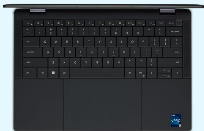
LATITUDE 9440 2-IN-1

World's smallest 14-inch commercial PC 6