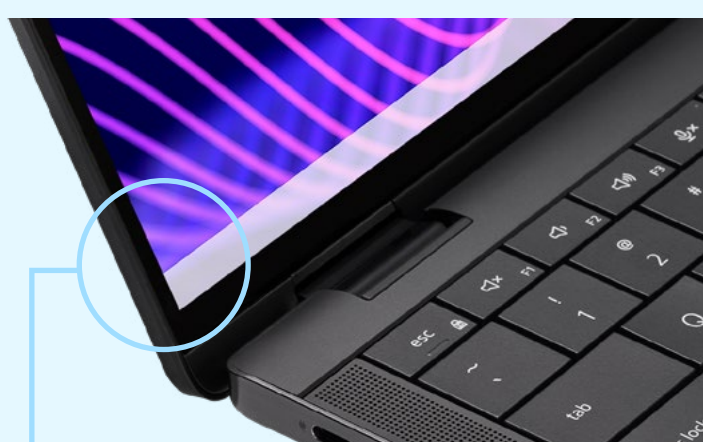
LATITUDE 9440 2-IN-1

World's best screen-to-body ratio on a 14-inch commercial ultra-premium PC 7