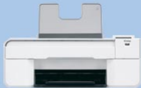
Dell Photo All-in-One Printer 924