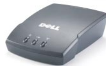
Optional Dell Wireless Printer Adaptor 3300