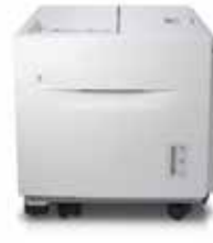
2,300-sheet High Capacity Feeder