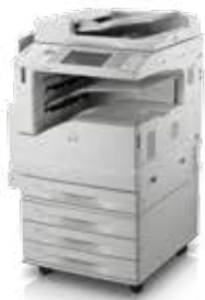
Configuration 1 (Standard)