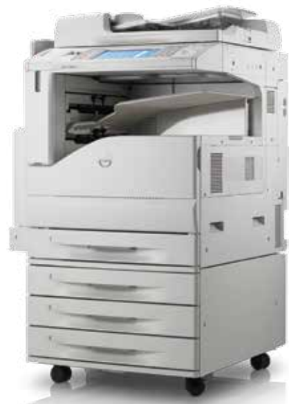
Dell™ Colour Multifunction Printer - C7765dn

Make demanding business printing needs easy with the C7765dn multifunction printer.