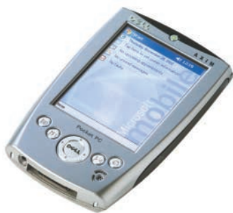
Dell Axim X5

The Dell Axim X5 comes with a removable Lithium-ion battery as standard and a higher capacity option for extended battery life. The Axim X5 also features a battery-charging slot designed to accommodate either capacities. The Axim X5's Performance model ships as standard with a USB Cradle featuring a battery-charging slot allowing you to dock and charge your PDA as well as keeping a spare battery charged at all times. The Axim X5 standard model ships with a USB synchronisation cable.