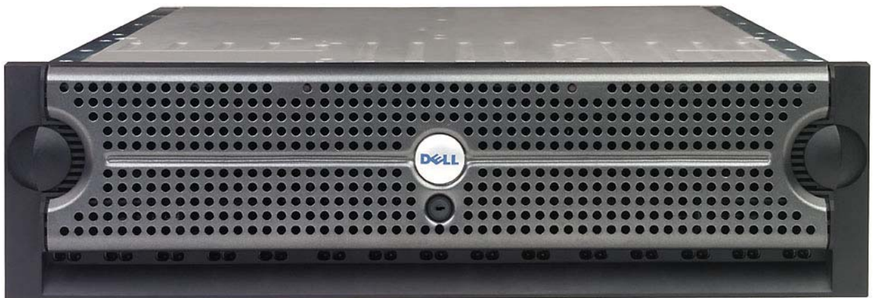
Figure 1: Dell PowerVault MD3000 Storage system with 15 SAS drives – Front view