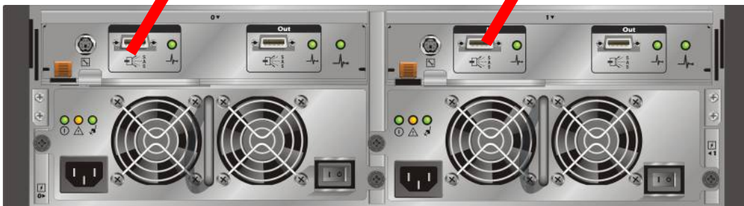
Dell PowerVault MD1000