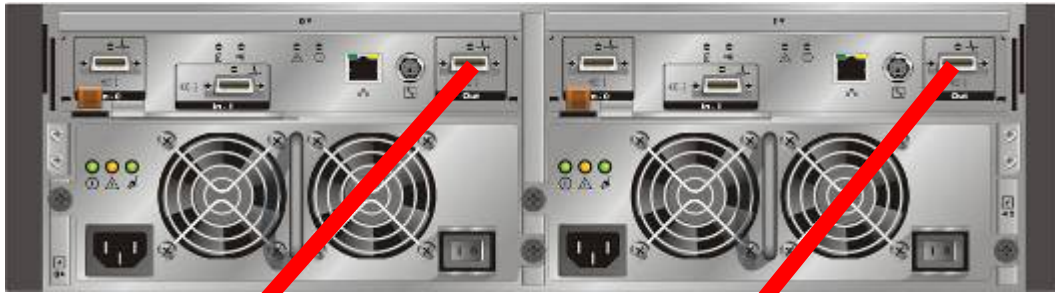
Dell PowerVault MD3000