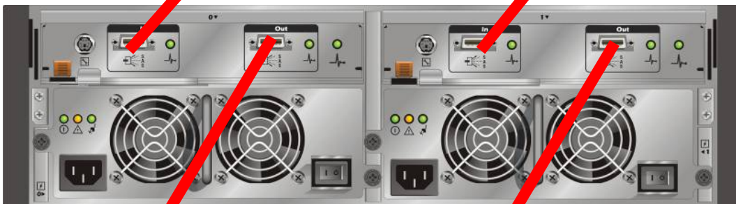
Dell PowerVault MD1000